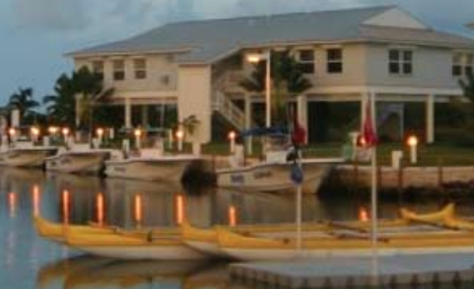
Brinton Environmental Center

Imagine thousands of square miles of underwater coral formations, peaks, valleys, and literally hundreds of different types of colorful fish. Your mask will become a kaleidoscope of colors as you glide effortlessly among pillars of coral and multi-hued fish. The warm, clear waters of the Florida Keys or the Bahamas give you the sensation of weightlessness in this underwater wilderness.